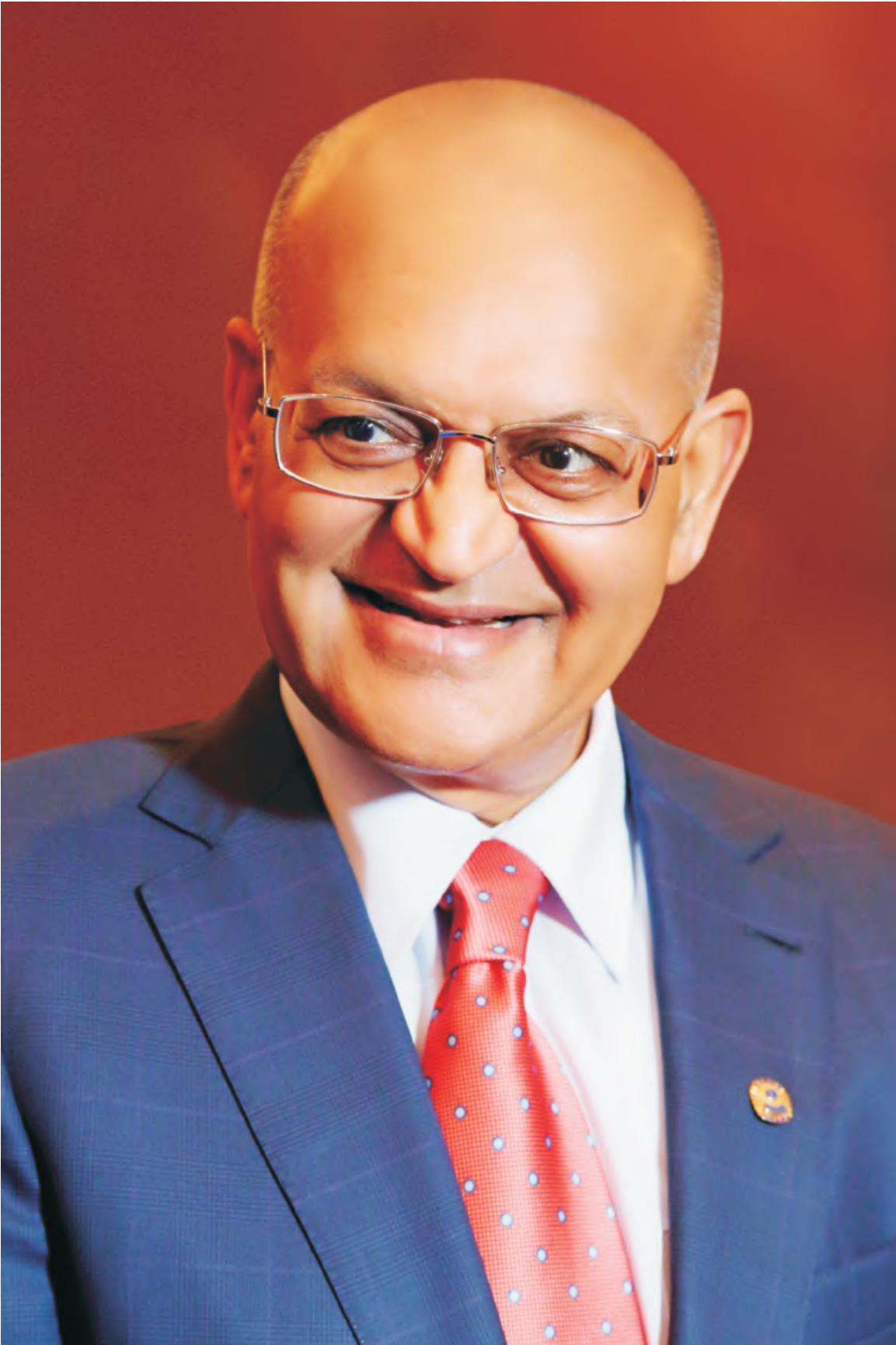
Hon'ble Late Shri Abhey Kumar Oswal