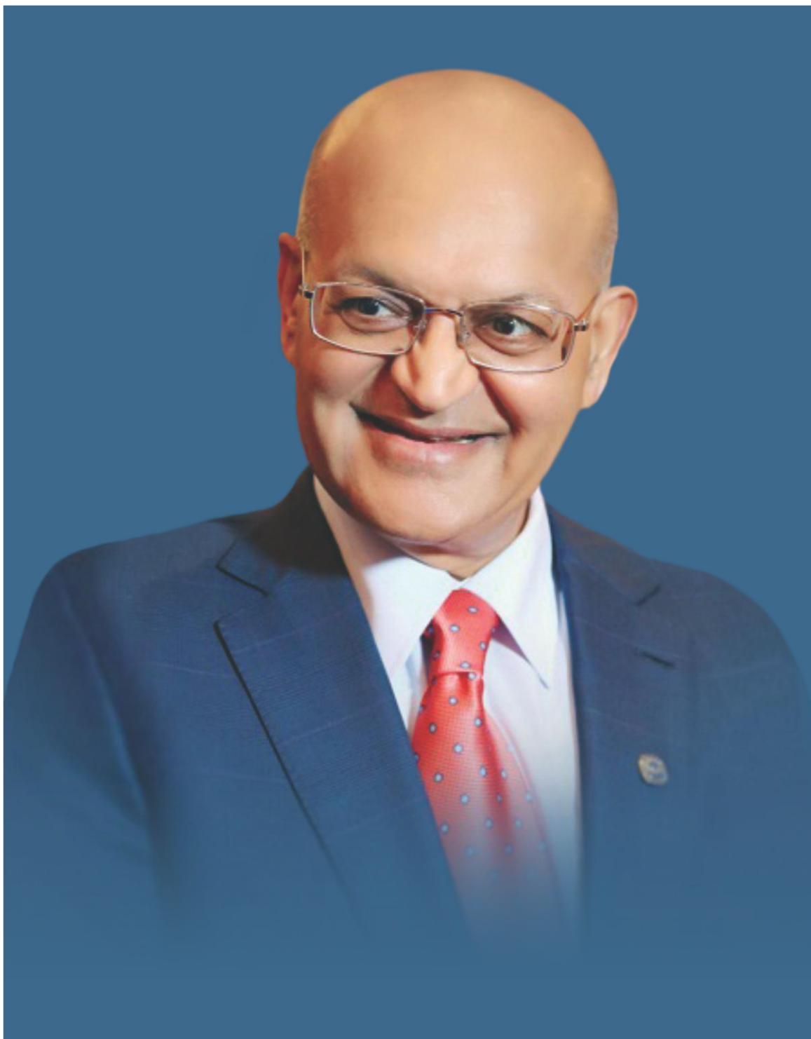
Hon'ble Shri Abhey Kumar Oswal