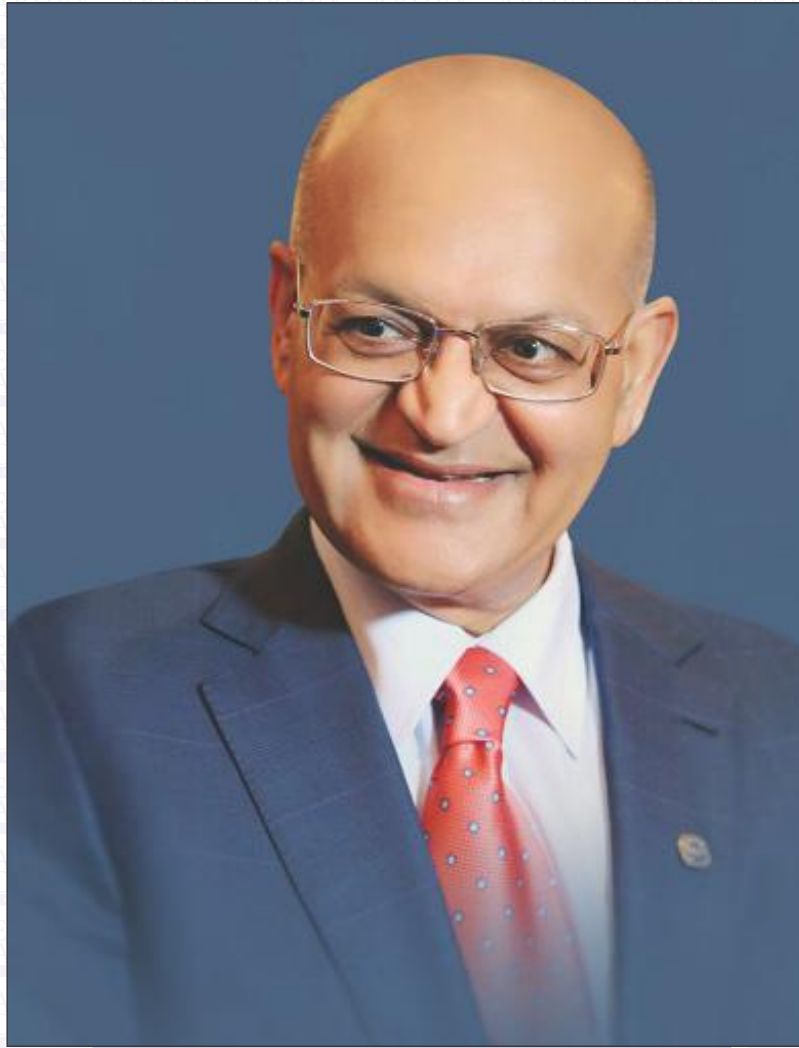
Hon'ble Shri Abhey Kumar Oswal